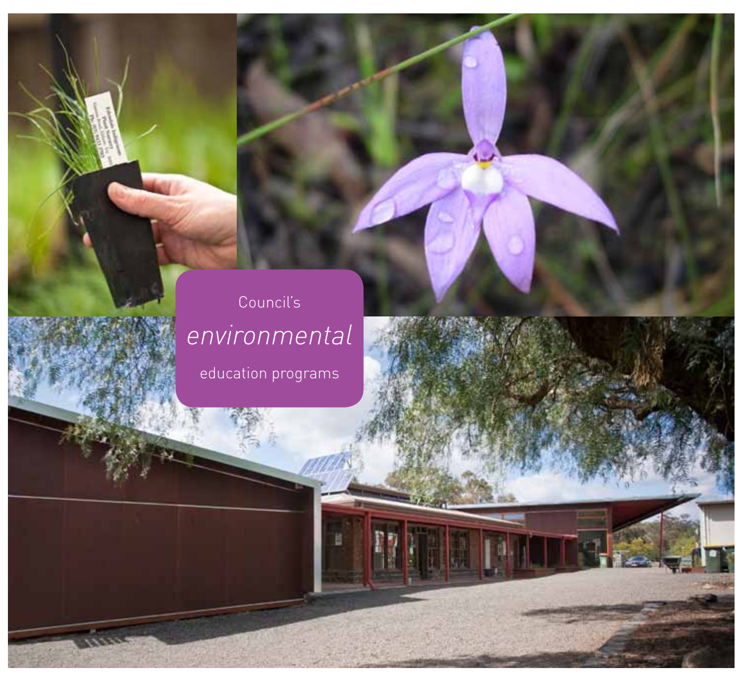
Table 2 outlines Council's current environmental education programs and projects aligned to Council's areas of responsibility (governance, people and community, economy and environment). Table 3 outlines Council's environmental education publications aligned to the same areas of responsibility. The environmental category is broadened to include biodiversity, energy, sustainability, waste and water. Table 4 graphically displays how current environmental education resources align to the Education for Sustainability framework.

Edendale, Council's community environment farm in Eltham, is a key site for the delivery of Council's environmental education programs and aims to demonstrate best environmental practice in all its operations.